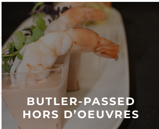
BUTLER-PASSED HORS D'OEUVRES

Shrimp Cocktail Shooter Caprese Salad Skewer